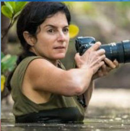
Ami Vitale National Geographic